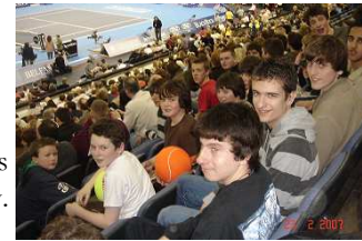
Pupils at the Tennis Legends event in the Odyssey.