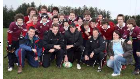
Three Ulster Players visit the Under 14 Team