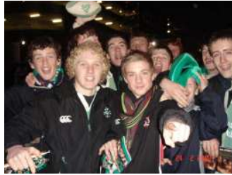
Medallion team on tour in Dublin