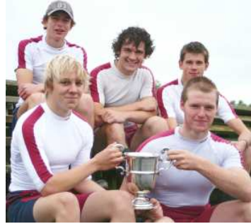
The J18 4 who defeated Portora in June to retain the Wray Cup.