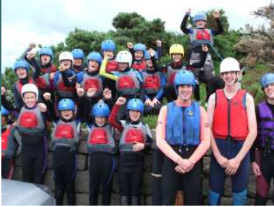
Some bouldering 'experts' at this year's biggest ever CAI Summer Camp