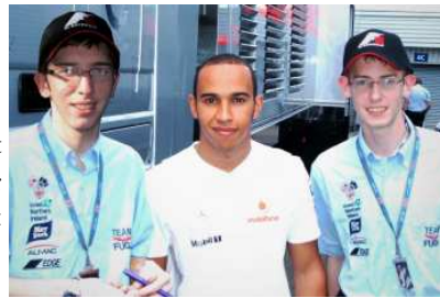
Team Fuga meet Formula 1 driver Lewis Hamilton at Silverstone.