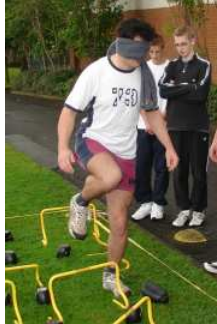
Some pupils working with the Royal Marines visibility team.