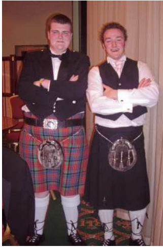
Photos from the 'school' formal