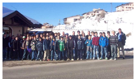
The ski party outside the hotel