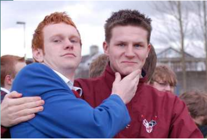
Spectators at the football