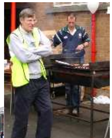
The men at work

In June CIFA organised a car boot sale including a BBQ, cake sale and car wash raising £600 for the school. The group have already donated 2 digital projectors to C.A.I. and last year also organised a quiz and a fashion show. Stripes look forward to seeing what they have planned for 2006—2007.