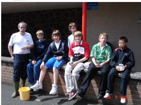
Some of the car washers have a rest